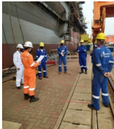
Mask-wearing & safe distancing in yards