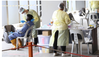
Routine testing for COVID-19