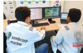
Transforming work processes to enable flexible & remote work arrangements